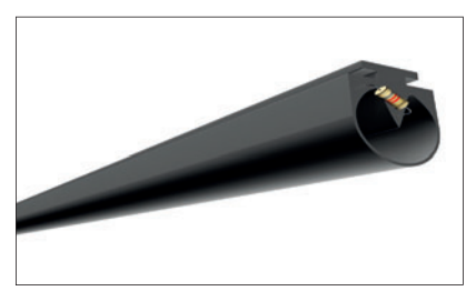
Conductive rubber normally open safety edge 8.2~k\Omega

The Carlo Gavazzi wireless system is compatible with alternative safety edges, for instance: