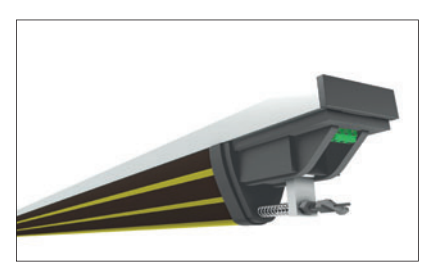
Mechanical normally closed safety edge